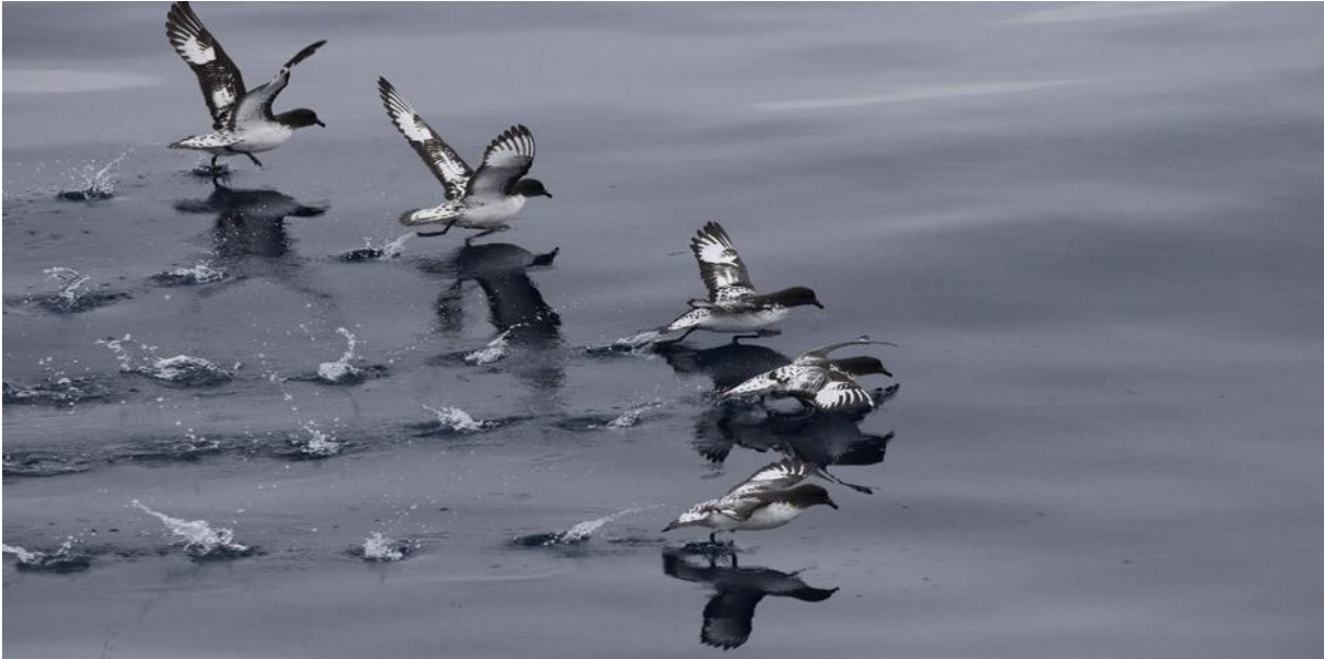
Cape (Pintado) Petrels, seen here taking off from calm waters

South Georgia also hosts some of the world's most stupendous wildlife spectacles, with millions of penguins being its most obvious inhabitants. Tens of thousands more albatrosses, petrels, diving-petrels, Antarctic Fur Seals, and Southern Elephant Seals roam the island's beaches and grassy slopes. The Antarctic Peninsula may garner more attention, but it cannot provide the overwhelming combination of beauty and wildlife found at South Georgia. A colorful human history rounds out the experience of a visit here. For more than fifty years, whaling stations on the island formed the hub of the South Atlantic whaling industry.