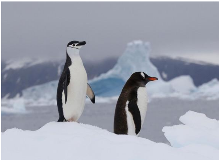
Chinstrap (left) and Gentoo Penguins on fast ice; Brown Bluff, Antarctica

In reaching the Antarctic Peninsula, we will voyage through magnificent waterways, protected bays, and deep-water fjords. We will see massive glaciers calving enormous chunks of ice into the sea, make numerous excursions to remote islands and hidden bays aboard Zodiac landing craft, and visit active scientific research stations.