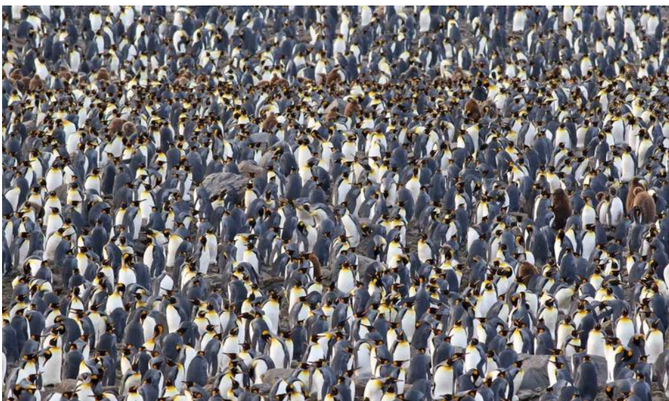
King Penguins, South Georgia

After lunch outside the park, we may have time for some coastal birding while en route to the ship. Many of South America's most elegant waterfowl use the near-shore waters and coastal ponds for breeding during the summer season. We will watch for Kelp and Upland geese, Crested Duck, Yellow-billed Pintail, Speckled Teal and Chiloe Wigeon. Red Shoveler, Flightless and Flying steamer-ducks are some of the more sought-after species that occur here. Beyond waterfowl, we're likely to encounter the beautiful Dolphin Gull, Brown-hooded Gull, and South American Tern.