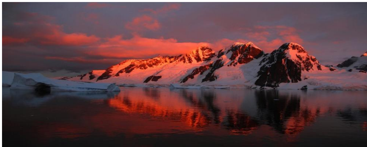
Unforgettable Antarctic Sunset

Gourdin Island – Located north of the tip of the Antarctic Peninsula, Gourdin Island is home to 14,000 pairs of Adelie Penguins as well as over 550 pairs of Gentoo Penguins.