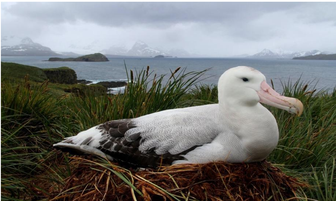
Snowy Albatross on nest, Prion Island, South Georgia

“Glittering white, shining blue, raven black, in the light of the sun the land looks like a fairy tale. Pinnacle after pinnacle, peak after peak—crevassed, wild as any land on our globe, it lies, unseen and untrodden.”