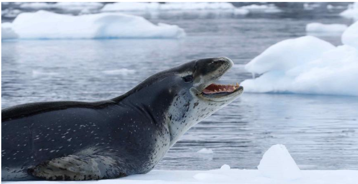
Leopard Seal demonstrating why it is one of the apex predators of the Antarctic

Bailey Head – Known as a hard place to land a boat, Bailey Head offers an unforgettable trapse up a glaciated valley into the heart of a massive colony of Chinstrap Penguins. Hundreds of thousands of penguins live here during the Antarctic summer and form long black-and-white processions as they move back and forth from the sea to their nests. The spectacle is overwhelming as seemingly every patch of ground up to the surrounding ridgelines is occupied by Chinstraps in various stages of the breeding cycle.