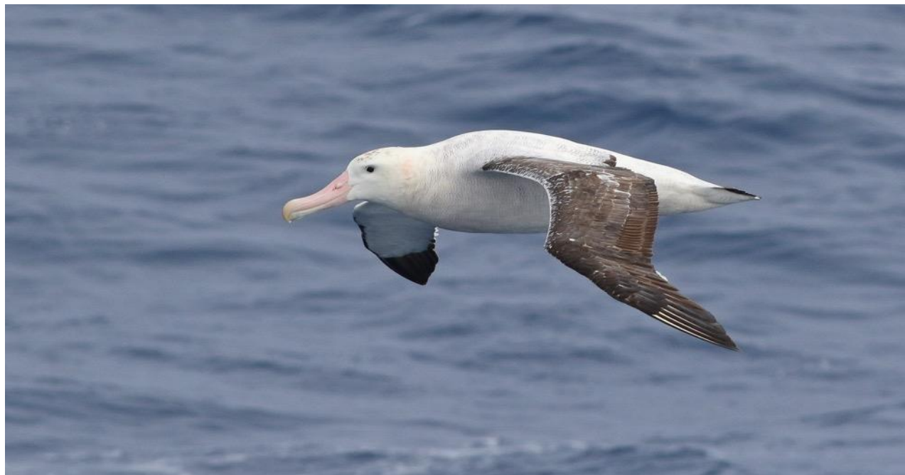
Snowy Albatross

December 31, Day 5: The Falkland Islands. Lying 300 miles off the coast of Argentina, the rainy, windswept cluster of islands known as the Falklands, occupy a remote corner of the South Atlantic. For many, the Falkland Islands are a historical oddity, the site of a short, but bitterly contested war between England and Argentina in 1982 over ownership of the islands. Today, the islands exist as a self-governing territory of the United Kingdom, with a population of 3,000, most of which resides in the territorial capital, Port Stanley (or just Stanley to locals).