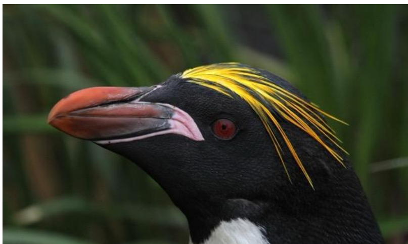
Amazingly, 70% of the world's Macaroni Penguins breed at South Georgia

Gold Harbor – Among the most famous of South Georgia’s wildlife viewing areas, Gold Harbor offers excellent access to elephant seals, fur seals, and King Penguins for starters. Steep, tussock-covered hillsides are the preferred nesting site of Light-mantled Albatross, and giant-petrels lounge on the beach. Besides the wildlife, majestic natural surroundings include glaciers, towering cliffs and a broad gravel beach.