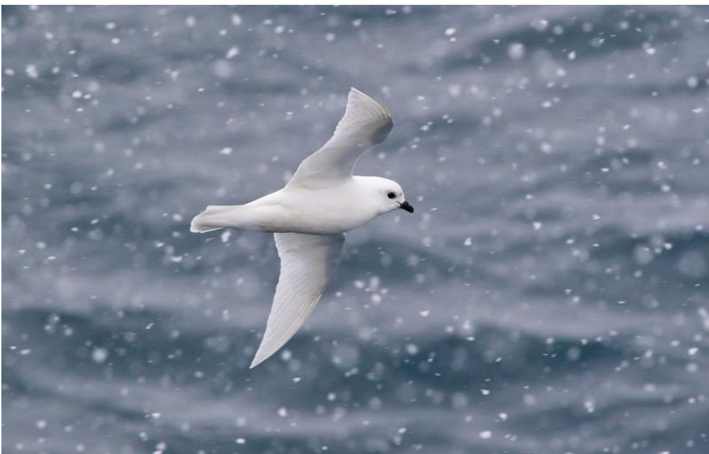
Snow Petrel

The first visible ice is likely to be smaller bergs that have drifted with the currents north from the Weddell Sea. In time the ice becomes more plentiful and larger until we begin to observe the massive remains of the disintegrating winter icepack. Icebergs of all shapes and sizes appear around the ship, from horizon to horizon. Cutting through the slushy water, the sound of ice debris scraping against the ship’s reinforced hull is unforgettable; the sight of giant chunks of ice floating like monuments will leave you mesmerized. In between you’ll witness icebergs of all shapes and sizes. Some appear as massive squared off edifices while others show up as wave-sculpted masterpieces. Behemoth tabular icebergs finally appear, broken off the continental ice shelf and adrift. Bigger than life, some of these bergs tower hundreds of feet over the ocean and stretch for over a mile. Ice often becomes compressed as it ages. When this happens, it loses its ability to reflect the full spectrum of colors that comprise white light and instead can only reflect blue. We’ll observe blue ice, some of which gleams incredible cobalt under overcast skies.