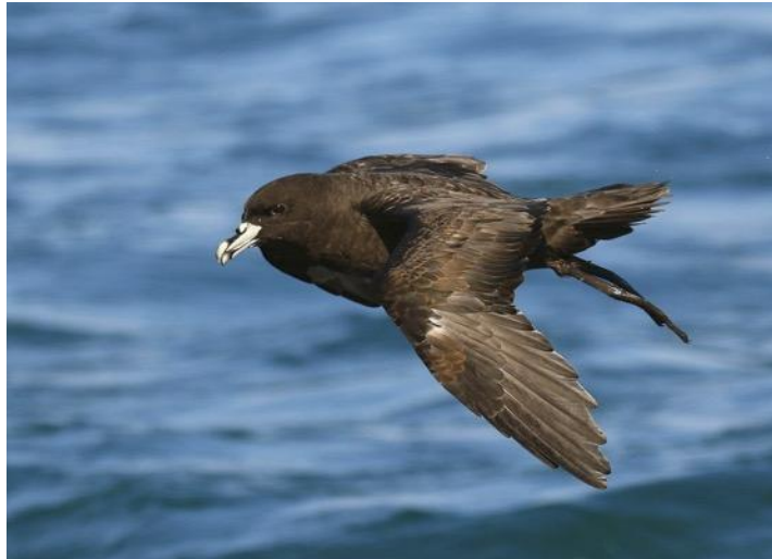
White-chinned Petrel

During our journey we are sure to witness a wondrous abundance of wildlife. The pelagic birding in these Antarctic and sub-Antarctic waters is among the best in the world. We should see as many as five species of albatross, including the lovely Gray-headed and the giant Royal (possibly both Northern and Southern), Light Mantled, and Snowy.