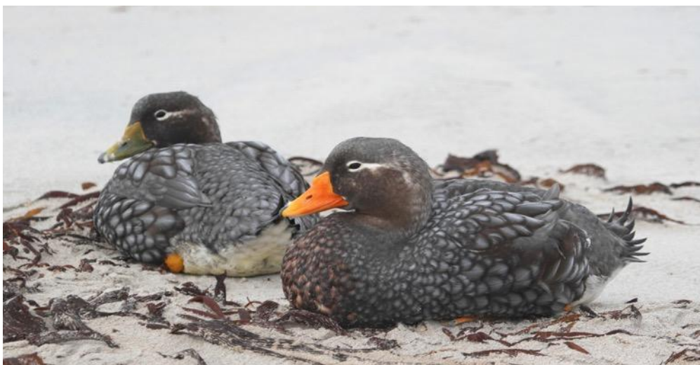
Falkland Steamer-Ducks, flightless and endemic to the Falkland Islands

The Falkland Islands are home to a number of birds and marine mammals that we will not encounter elsewhere on the voyage. Following is a list of notable residents of the islands, some of which we'll seek: