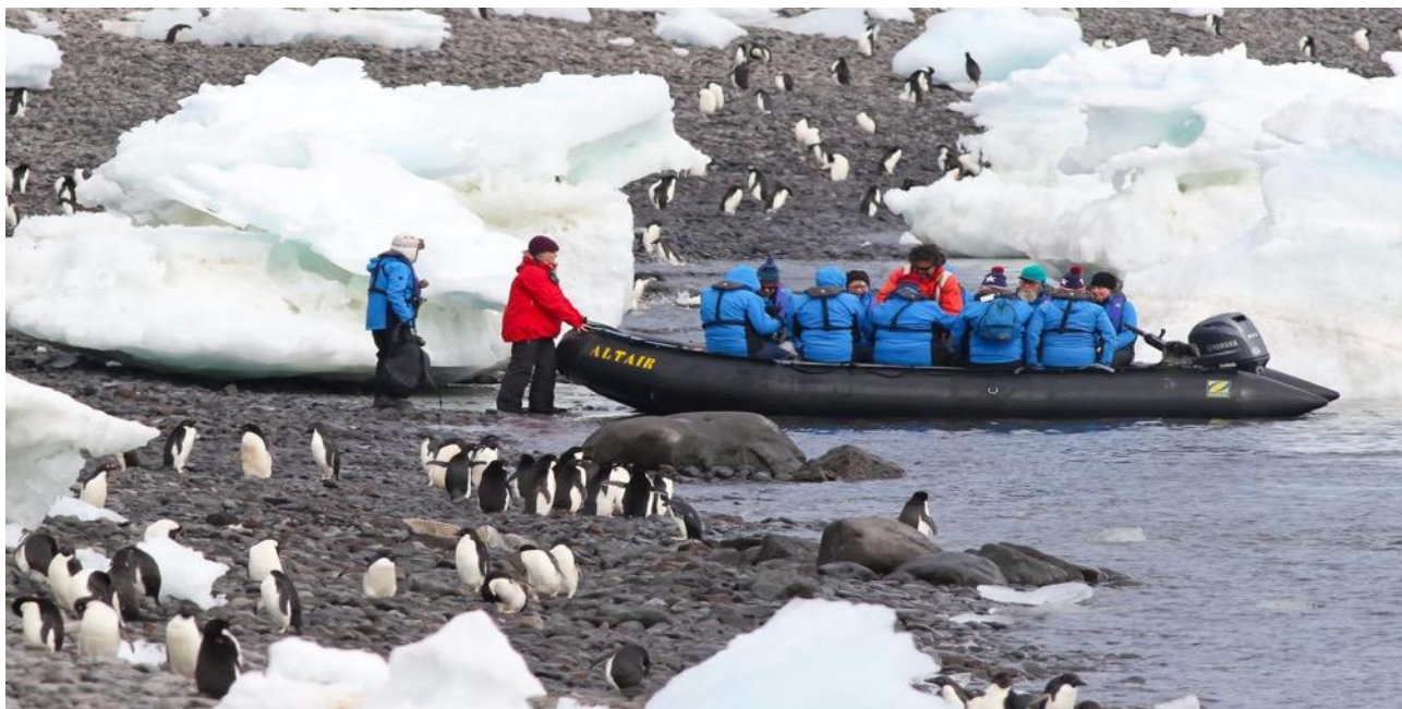
Zodiac landing at Paulet Island

As a bonus, an optional two-night Buenos Aires Pre-trip is available for those who desire more birding time on the South American mainland than is offered in this program or who simply want to break up the long trip to Ushuaia. This trip will visit at least two high-quality birding areas in the Buenos Aires area where we expect an array of landbirds and waterbirds.