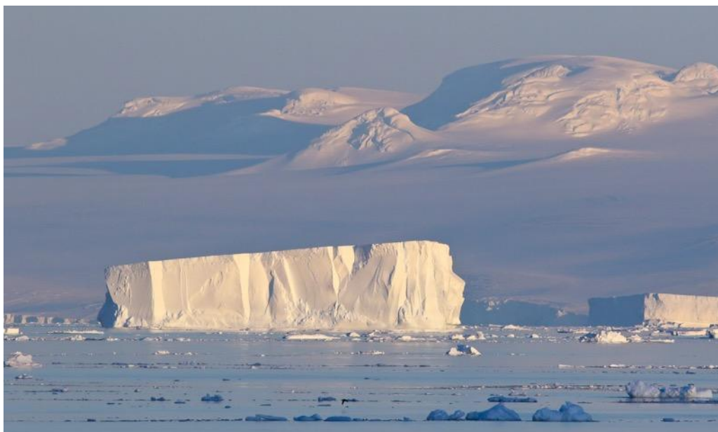
Antarctic Sound

The onset of the Antarctic summer allows us to experience the rich colors of the sea and ice, the dramatic etchings of coastlines, and the sheer walls of towering icebergs. The pristine air lends an unusual quality to Antarctic light, so that colors are truer and landscapes sharper. We can clearly see snow-capped peaks on every horizon, often tinted rose-red or burnt orange by the late evening sun.